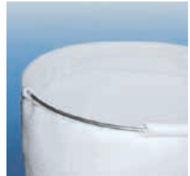
SNAP-RING seal ring