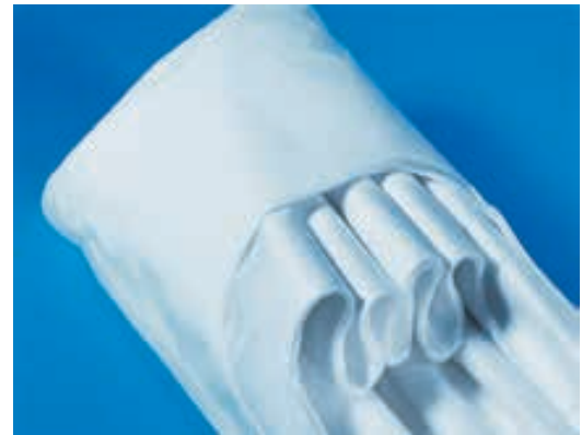
A pleated pre-filter offers a very large filter area (approx. 32 ft² (3 m²)), to retain gels and solids before they reach subsequent filter layers.