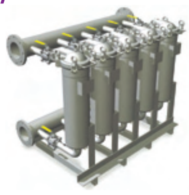
MODULINE™ systems are a compact and efficient bag filtration solution for a range of water filtration needs where continuous flow is required.

Water quality agencies have come to rely on Eaton's automatic self-cleaning and mechanically cleaned strainers to remove sediment, turbidity, iron, and suspended solids commonly found in surface and ground water. These high quality filters as well as Eaton's other filtration products help cities meet their watershed protection obligations for effectively protecting public health and restoring aquatic ecosystems. Eaton's goal is to support municipalities in their efforts to further enhance the quality of life, economic growth, and the protection of vital resources.