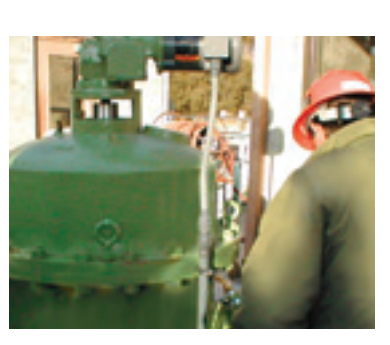
Eaton automatic strainers provide filtration of 100 micron and above. They are the perfect solution for the protection of plant equipment including spray nozzles, pump seals, water reinjection systems, water recycling systems, etc., in wastewater plants.