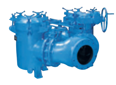
Model 50 butterfly valve duplex basket strainer is a special design with several important features and advantages for large size pipelines with high flow rates.

Automatic strainers for protection of pumps and injection wells in aquifer recharging applications